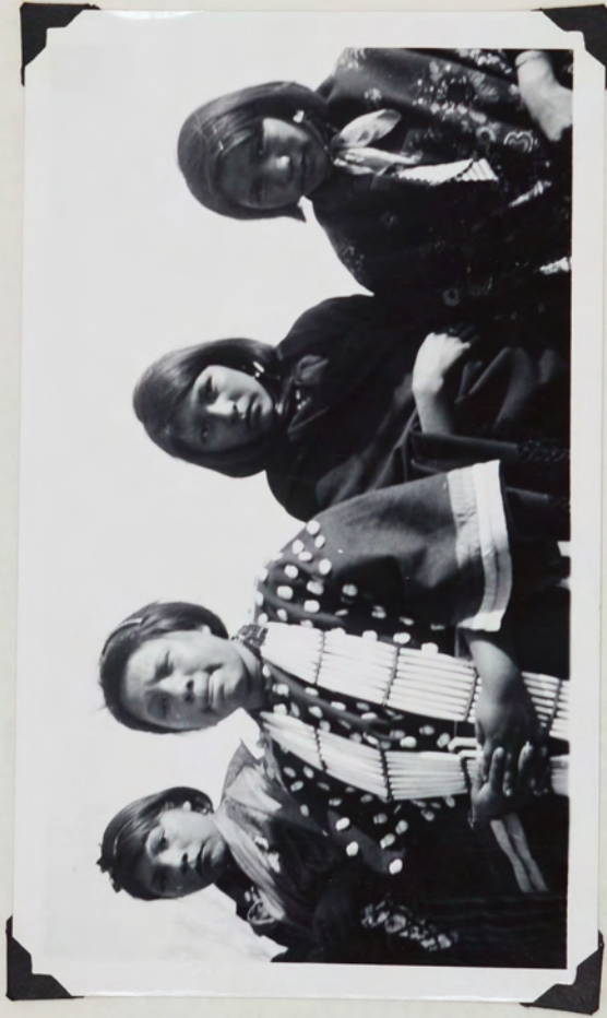
School girls dressed for the Bear Dance