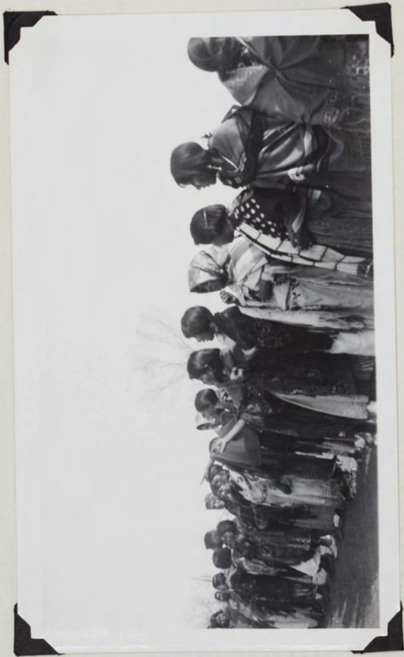
The Bear Dance